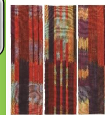
'Leap Year' (2012)