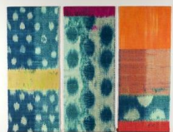
'Shadow of the Silk Road' (2011)