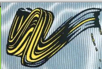
'Brush Stokes' (1965)

Exploring pop art through the work of American artist Roy Lichtenstein