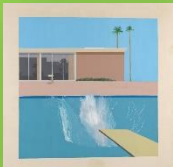
'A Bigger Splash' (1967) by British artist David Hockney.