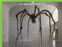
'Maman' (1999) by French artist Louise Bourgeois.