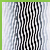
'Arrest 1' (1965) by British artist Bridget Riley.