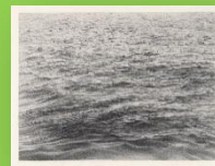
'Ocean' (1970) by Latvian artist Vija Celmins.