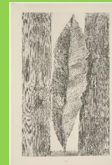
'The Habit of Leaves' (1925)