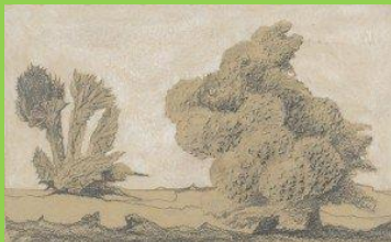
'The Start of the Chestnut Tree' (1925)

Exploring frottage through the creator of the technique: