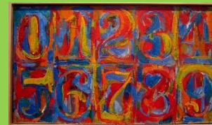
'0-9' (1960) by American artist Jasper Johns.