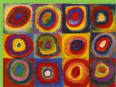
'Squares with concentric circles' (1913) by Russian artist Wassily Kandinsky.