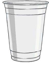
Two clear, plastic cups