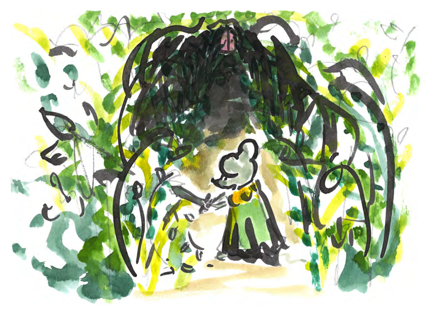
He hacked his way through to the castle door.