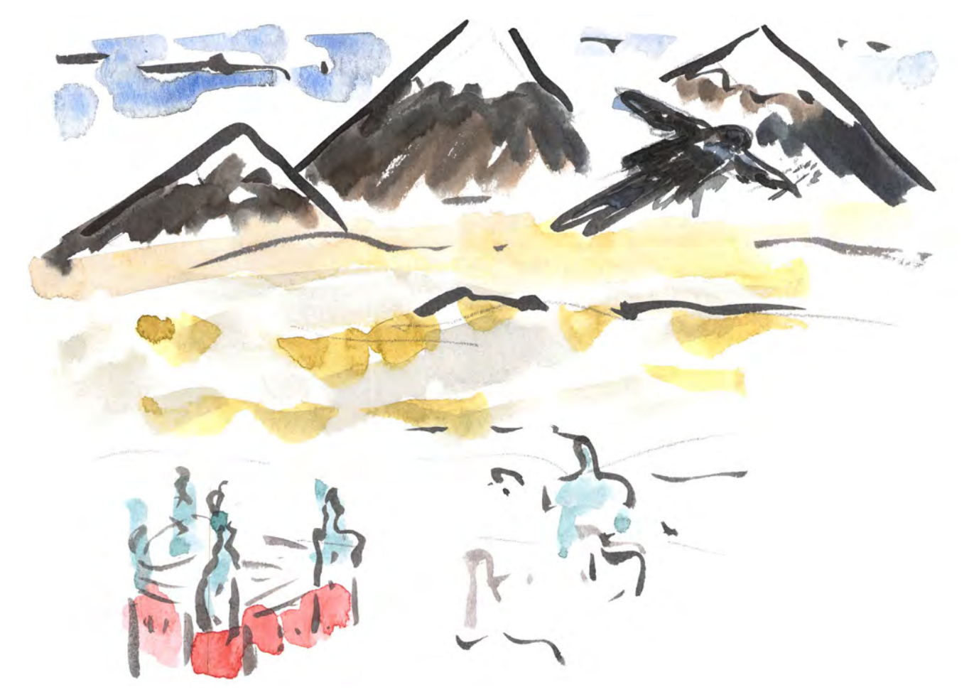
The king and the queen were so upset! The bad fairy flew away.