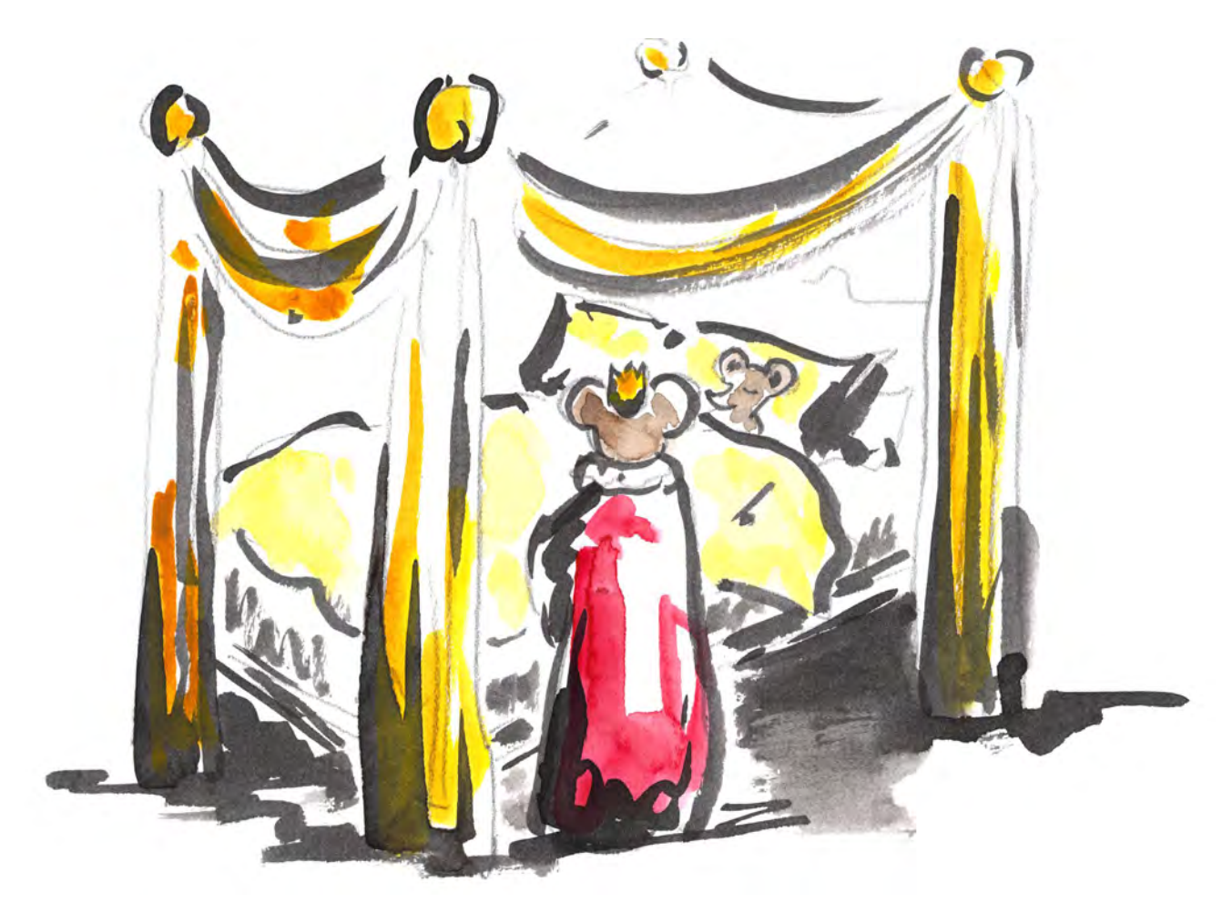
The good fairy could not undo the spell.