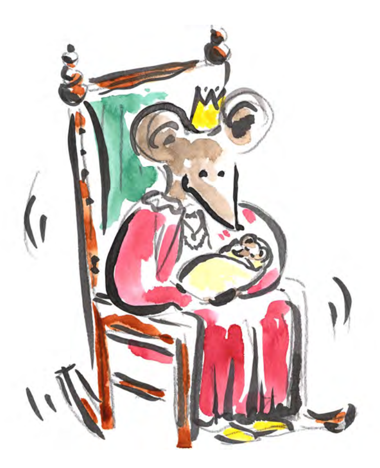
Then one day, a baby arrived! They called her Aurora.