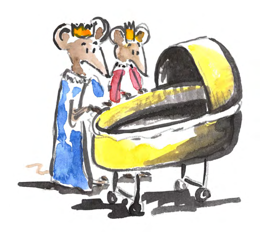
The king and queen are very sad. They have no baby.