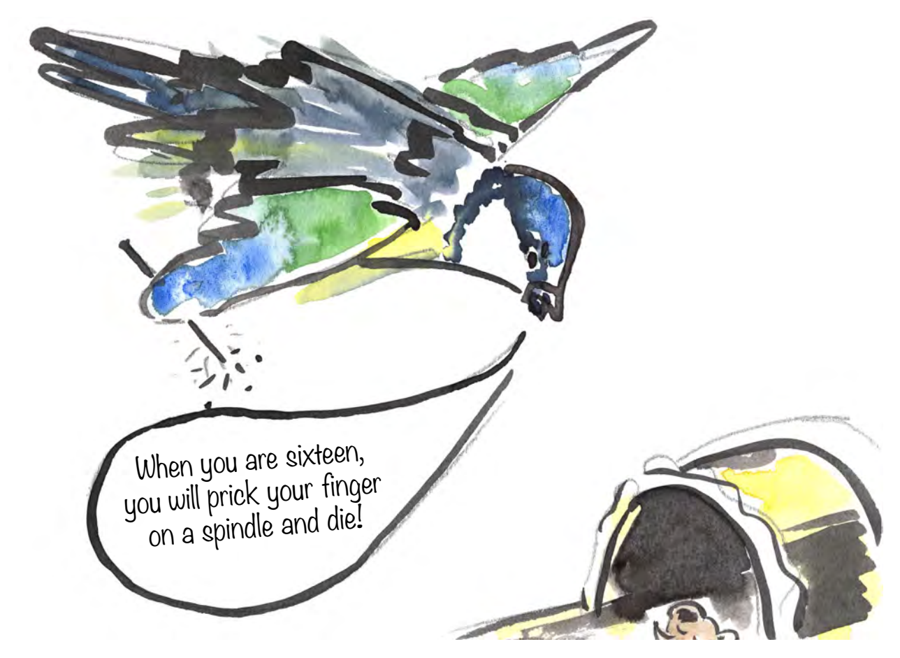
Then the cross old fairy flew down. The king and queen were afraid. She cursed the princess.