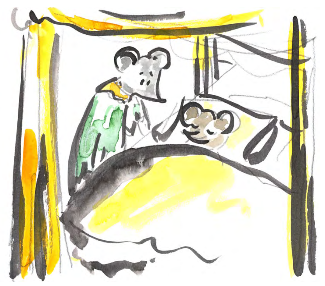
He made his way in through the castle to where the princess lay, still sleeping.