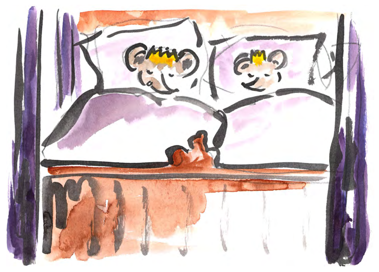
She knew that the princess would be alone and sad if she woke up in 100 years and everyone had died. So she put everyone else to sleep as well.