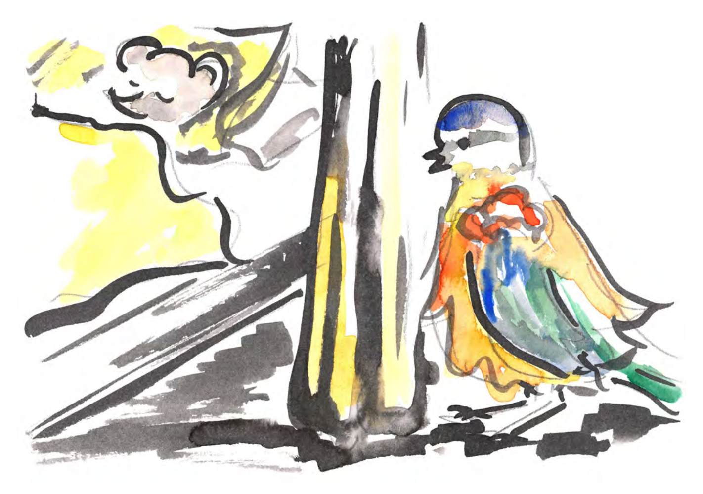
They took her to her bed and called the good fairy.