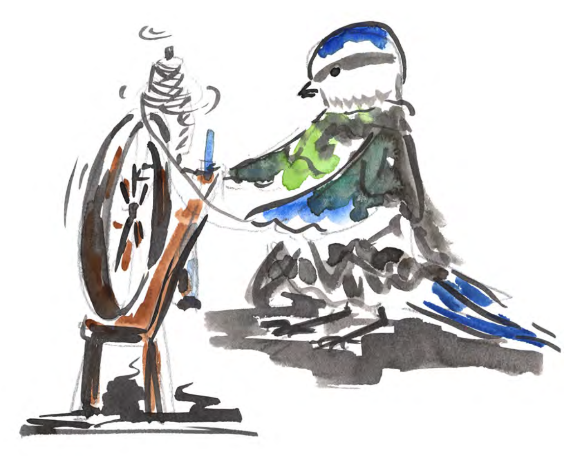
In a dark corner she found an old fairy. She was spinning some silver thread.