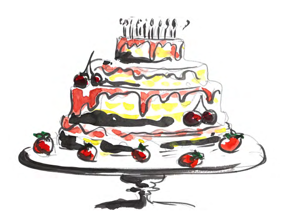
At last the princess had her 16th birthday. Everyone had a great time!