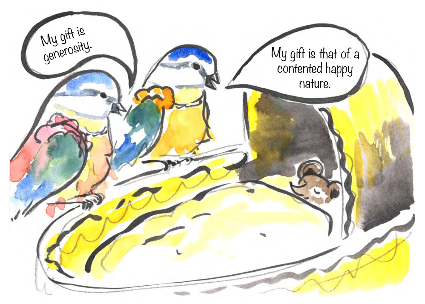
The first six fairies each gave the baby a magical gift.