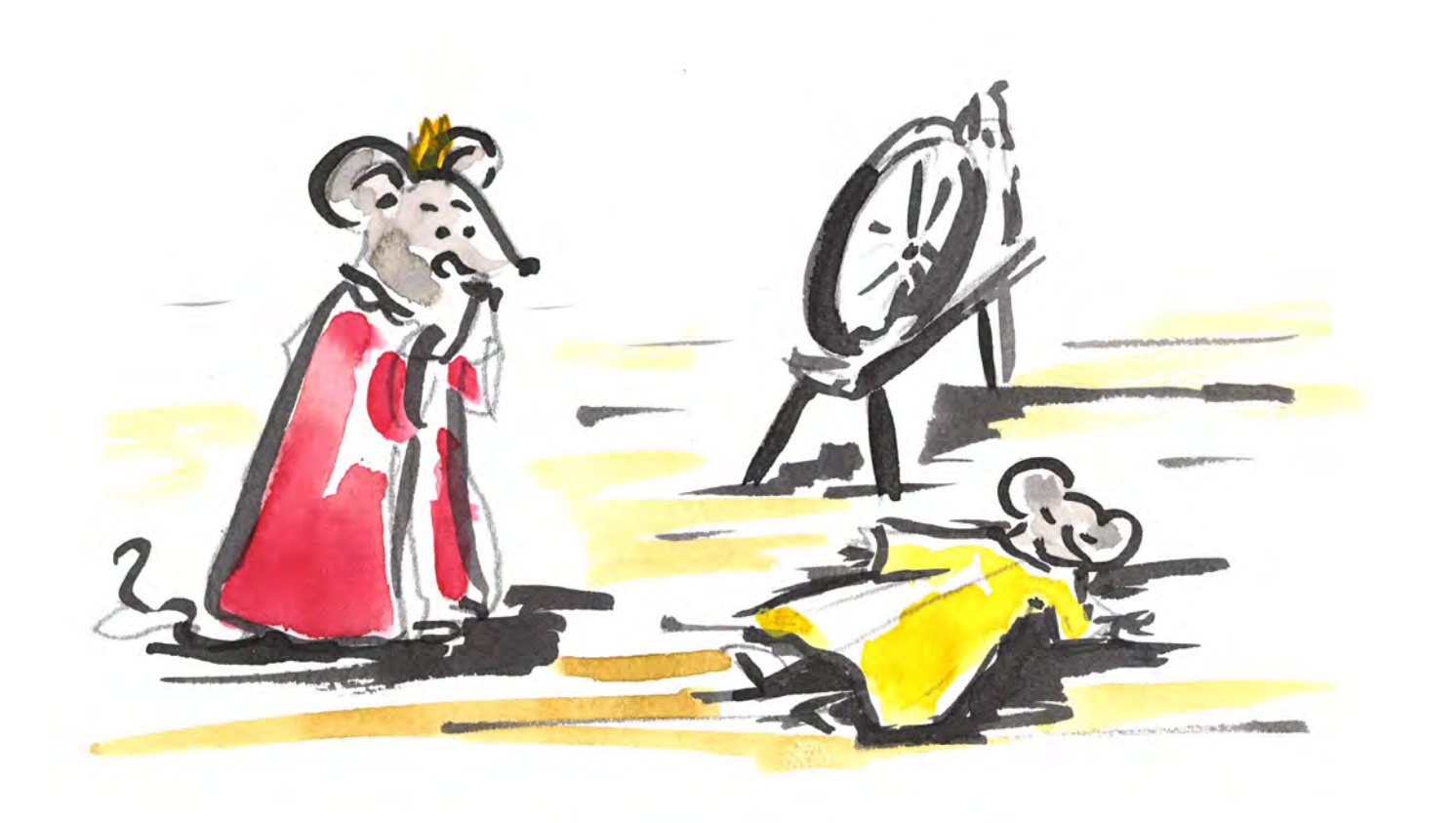
In the morning the queen and king found her.