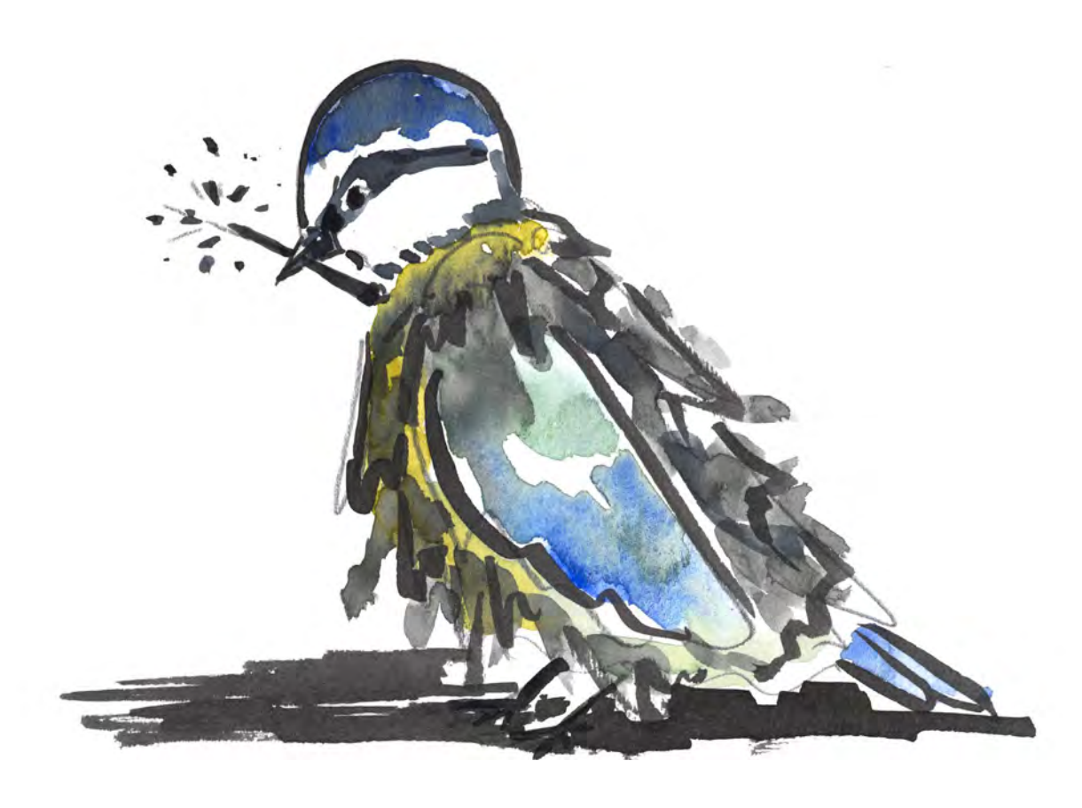
But the king and queen had forgotten to invite one very old fairy. She was very angry.