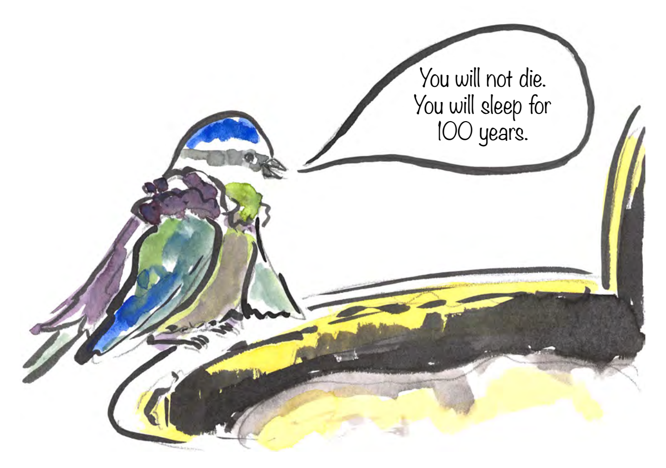
The 7th fairy flew to the cradle. "I cannot undo the spell," she told the king and queen. "But I can make it less bad."