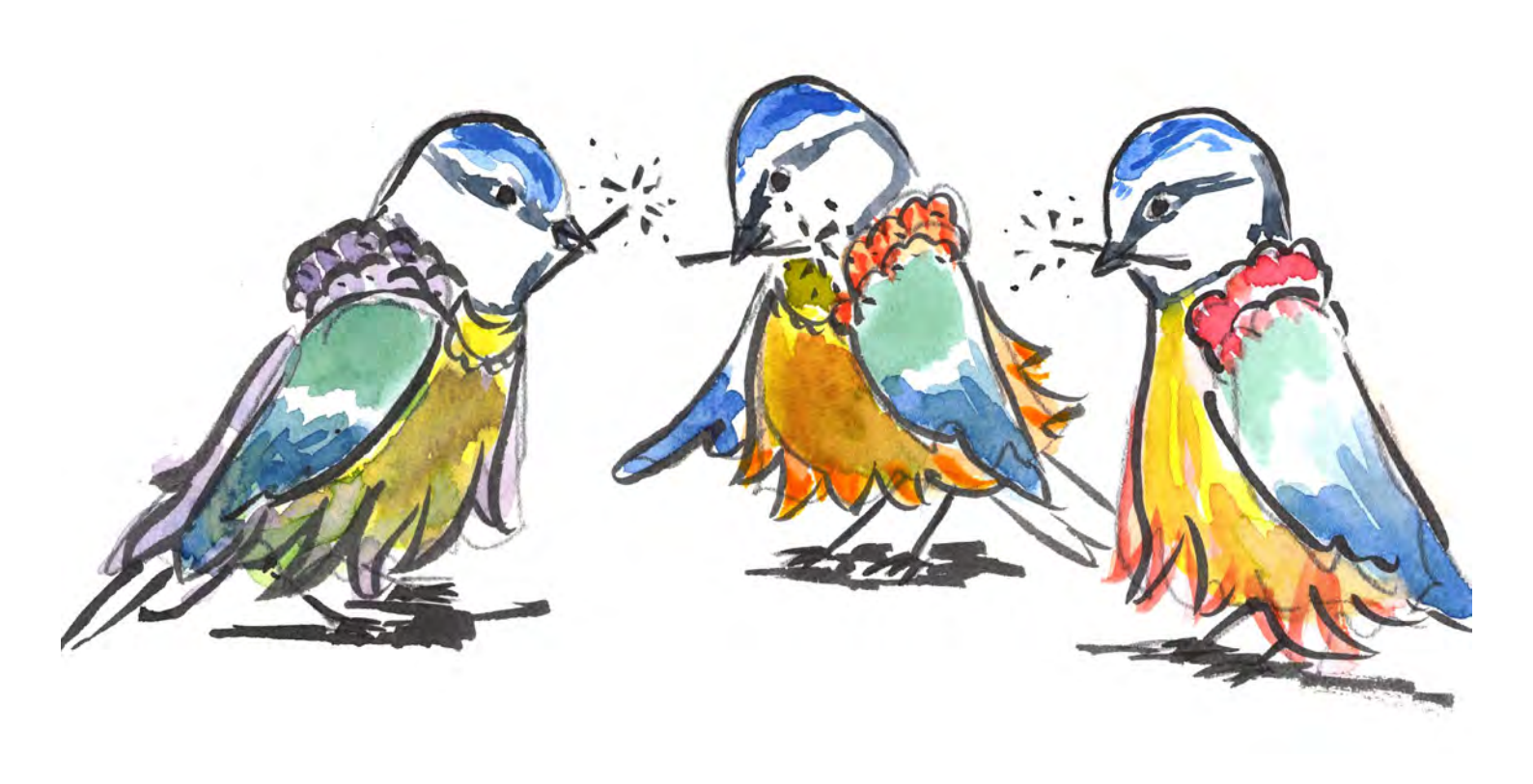
The king and queen were so happy. They had a big party and invited seven magic fairies.