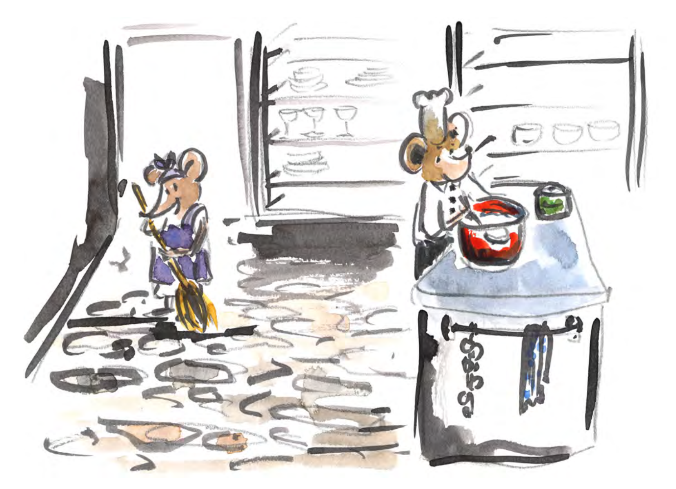
Everyone in the castle also woke up.