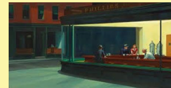
'Nighthawks' (1942) by Edward Hopper.

Hopper did several paintings depicting urban life. This painting, like most of his work, is based in realism.