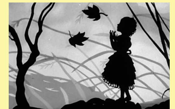
Shadow Puppets by Lotte Reiniger