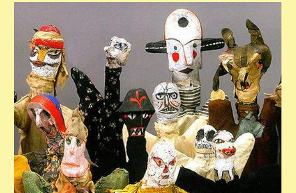
Puppets by Paul Klee