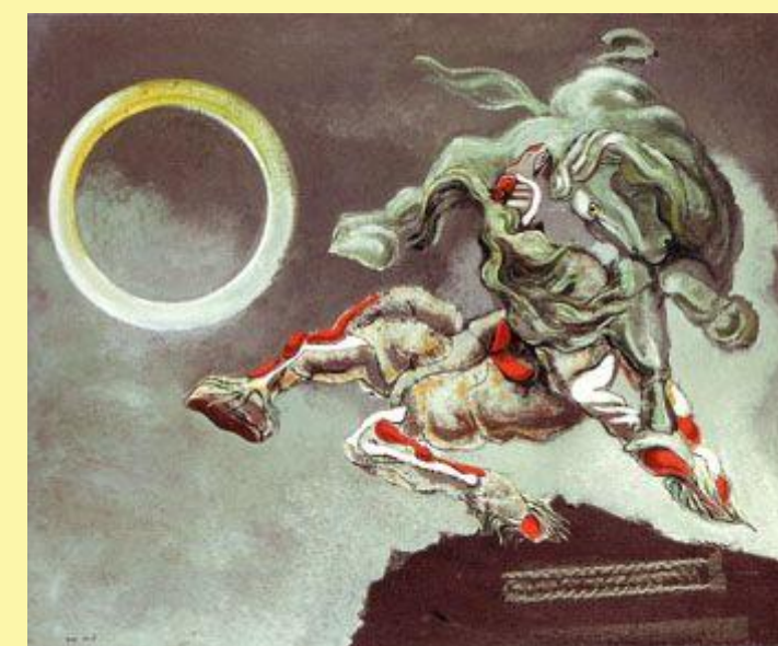
'The Bride of the Wind' (1972) by Max Ernst